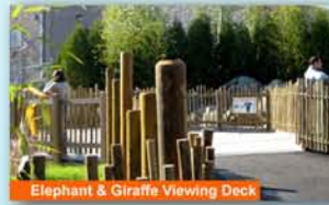
Elephant & Giraffe Viewing Deck