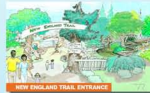
NEW ENGLAND TRAIL ENTRANCE

Thanks to a referendum passed in November of 2006, the Roger Williams Park Zoo has been undergoing many changes in order to update our look. Already completed and newly introduced are the New England Trail and the Fabric of Africa areas. Furthermore, we intend to reopen our popular Polar Bear exhibit with a new state of the art facility, which is slated for completion around 2010! If you are interested in keeping abreast with zoo changes then please feel free to visit our New Zoo website (listed below), the one and only source for all New Zoo information!