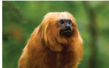
Golden Lion Tamarin