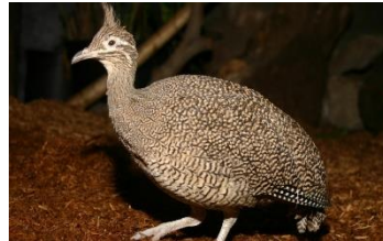
Elegant Crested Tinamou