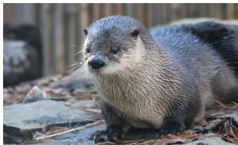
North American River